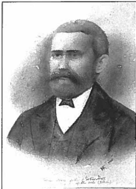
Figure 1: Before restoration

Thought I'd drop you a line and see if you are still working on your family history. I know as a teacher it must be difficult to find the time, but it is obvious from your earlier letters that you enjoy it.